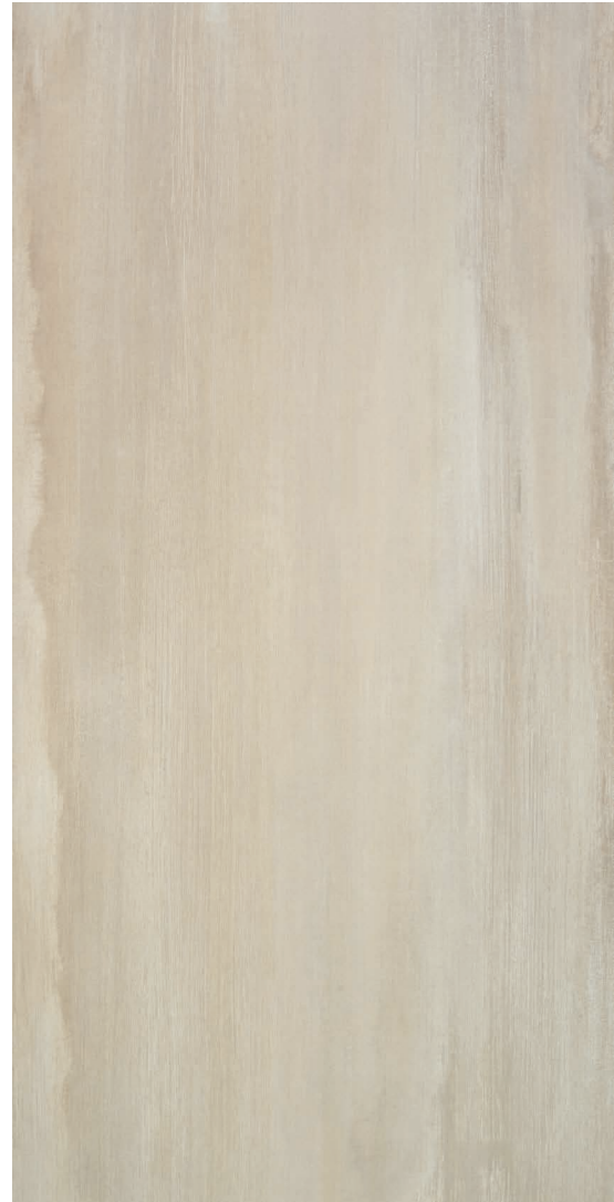
BEIGE Matte Finish

60 x 120 cm (23.622" x 47.244") UN.RV.PRL.2448.MT