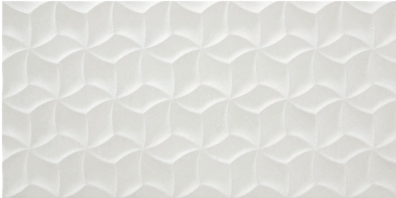
PEARL LIGHT 3D Matte Decor

25 x 50 cm (9.85" x 19.69") UN.RV.PRL.1020.3D.DC