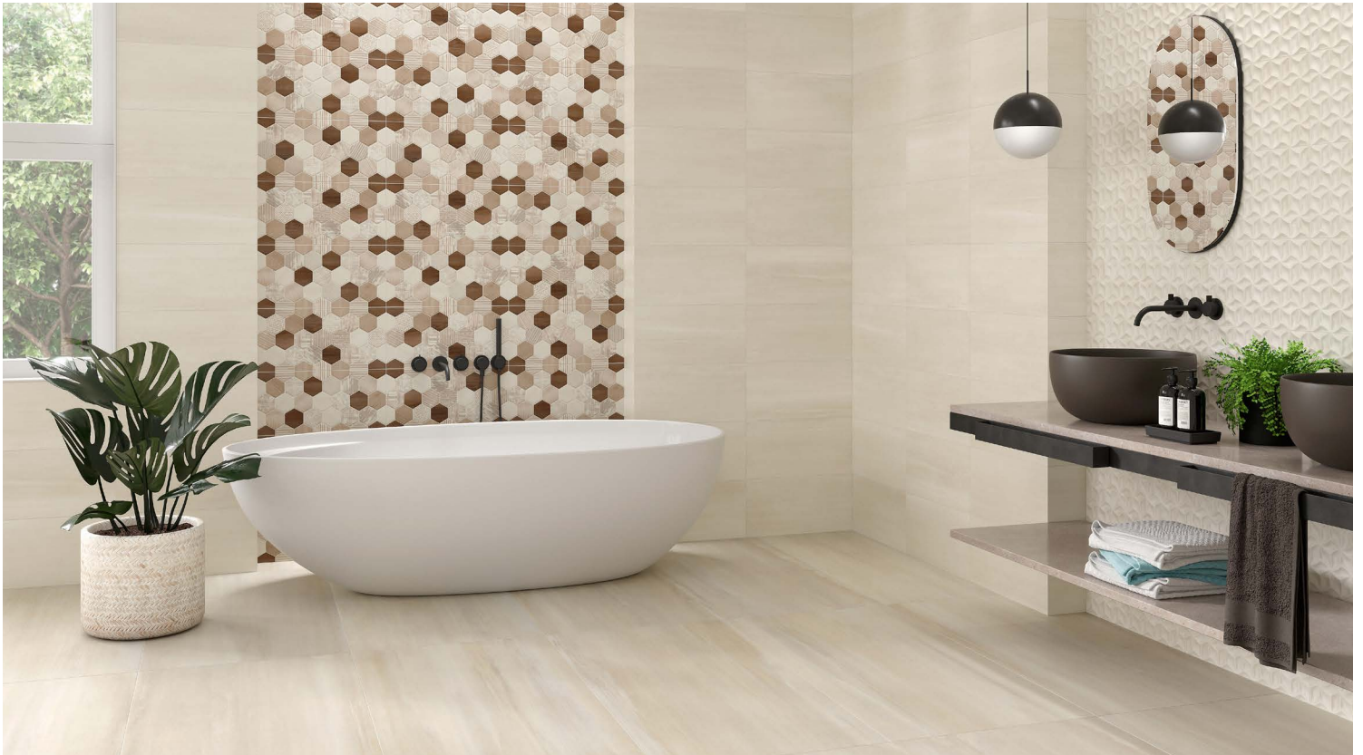
BEIGE LIGHT - wall and decor wall on right; BEIGE - floor