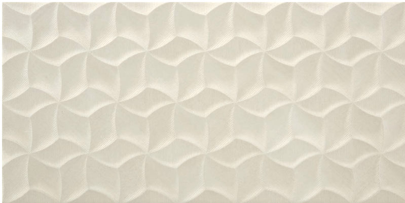
BEIGE LIGHT 3D Matte Decor

25 x 50 cm (9.85" x 19.69") UN.RV.PRL.1020.3D.DC