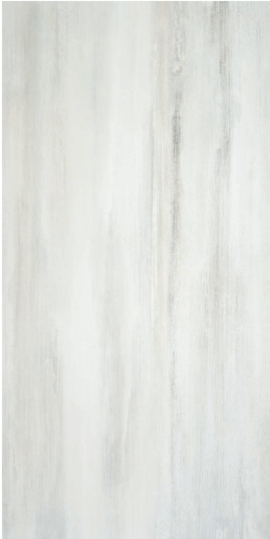
PEARL Matte Finish

60 x 120 cm (23.622" x 47.244") UN.RV.PRL.2448.MT