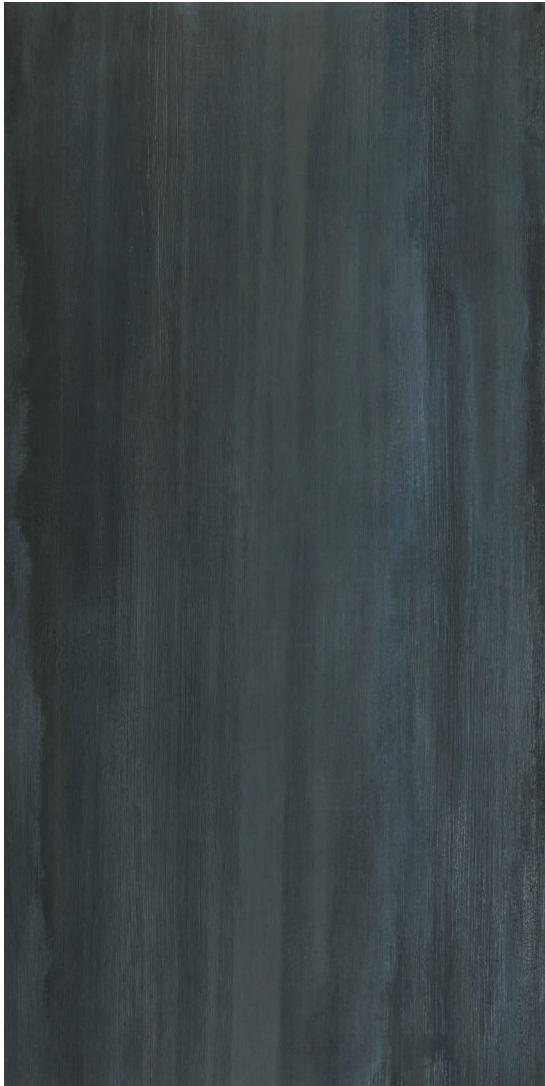
PETROL Matte Finish

60 x 120 cm (23.622" x 47.244") UN.RV.PET.2448.MT